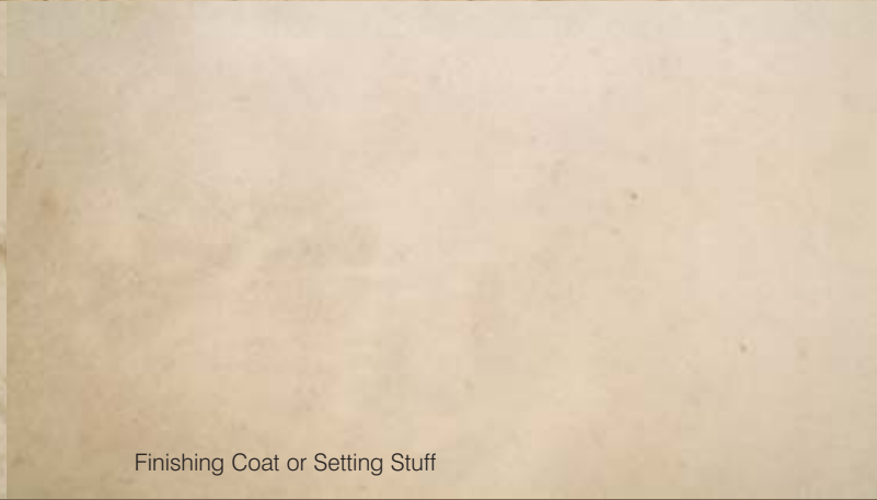
Finishing Coat or Setting Stuff