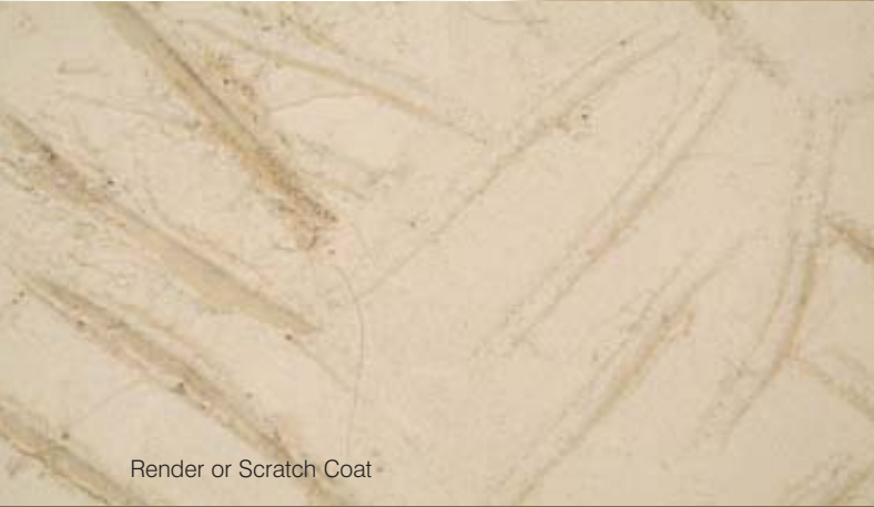
Render or Scratch Coat