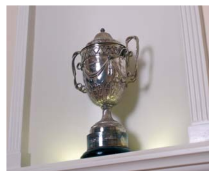
The Plasterers Awards Trophy