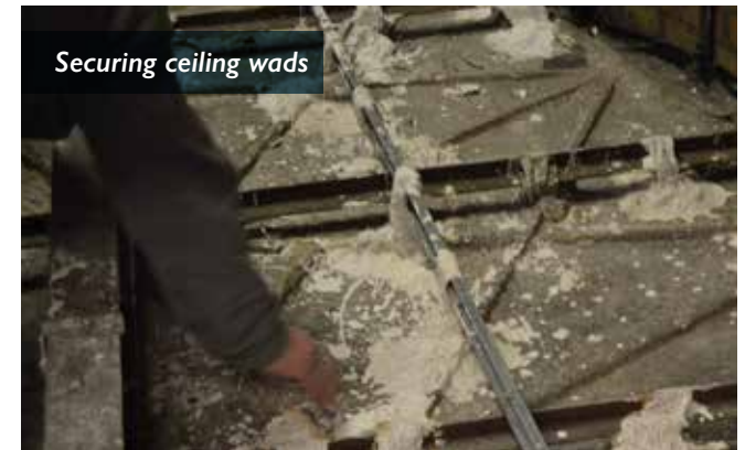
Securing ceiling wads

We follow ABTT Guidance Note 20 and best practices as outlined by Historic England.